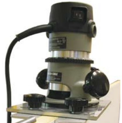
The Stylizer II is designed to make a EuroGroove on the edge of a door.